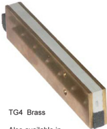
TG4 Brass Also available in aluminium and stainless steel

TG4 Intermediate Movement Joint with VAMAC Rubber and F025 Flame Retardant Foam For use in: Rail stations • Underground Stations • Subways hospitals • airports • shopping malls • exhibition halls