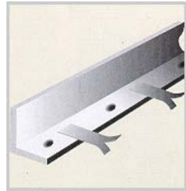
Heavy Duty Angles

FOR MORE INFORMATION TELEPHONE: +44 (0)1782 536719